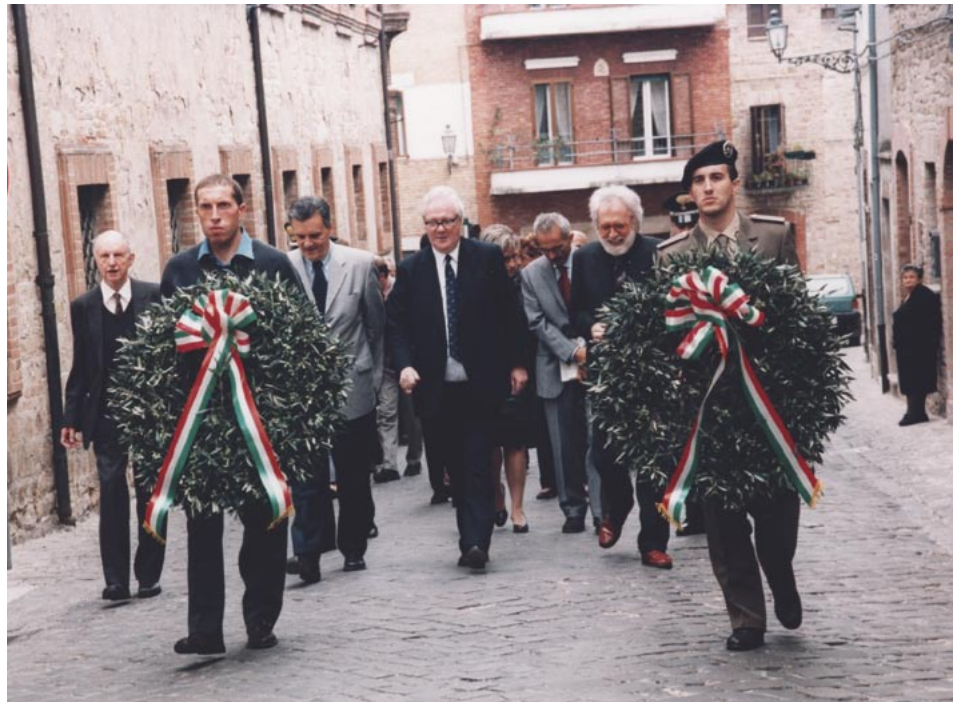
Procession in September 2000 before depositing the wreaths beneath the statue of Gentili

The connection between Oxford and San Ginesio is not merely historical. Their shared concern with secular international law and its Romanist roots bears on several problems now facing the international community, including that of the justification for making war.