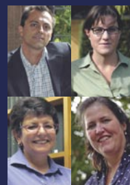
STAFF ARRIVALS page 11