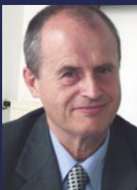
PROFESSOR PETER BIRKS page 4