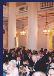
MANSION HOUSE RECEPTION page 8